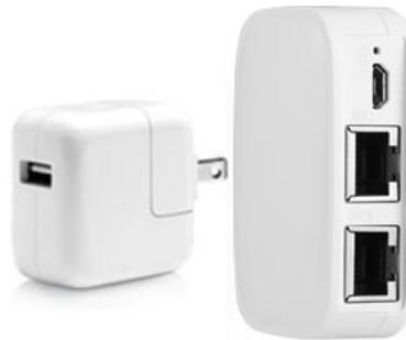
Cellphone Power Supply