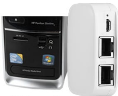
USB Power Charge