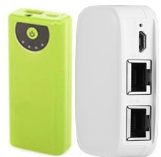
Mobile Power Supply