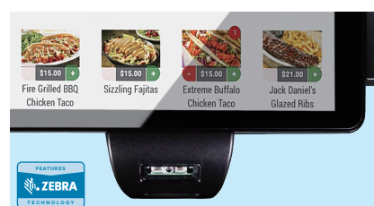
Price Checker (Zebra Engine Inside)