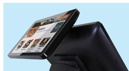
2nd LCD Display