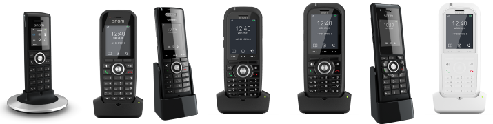
M25 M30 M65 M70 M80 M85 M90